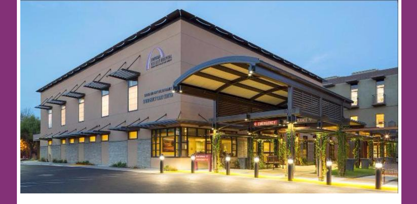
Inspiring Support for Sonoma Valley Hospital

Thank you for your continued support of the Sonoma Valley Hospital Foundation and helping to ensure quality health care for the Valley!