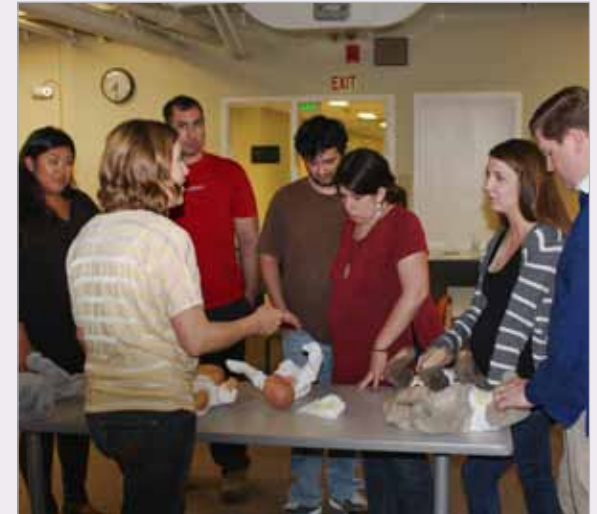
Expecting parents attend one of the childbirth preparation classes held regularly at the Hospital.