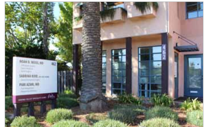
The Hospital's second physician timeshare office opened this year on West Napa Street.