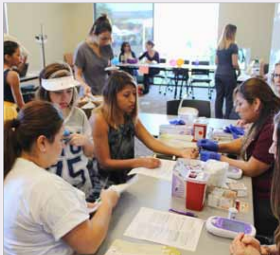
SVH participates in the Community Health Fair held at the Community Health Center.