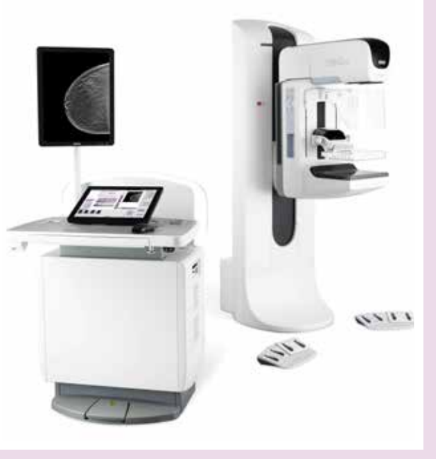
3-D Mammography System

"We're proud to start offering tomosynthesis to our patients at Sonoma Valley Hospital. Tomosynthesis has been shown to increase detection of invasive breast cancer by over 40 percent. There is also a reduction of up to 40 percent in the number of women called back from screening mammography for additional imaging. Fewer women called back translates into less patient anxiety, less additional imaging, and fewer biopsies." - Natalya Lvoff, MD