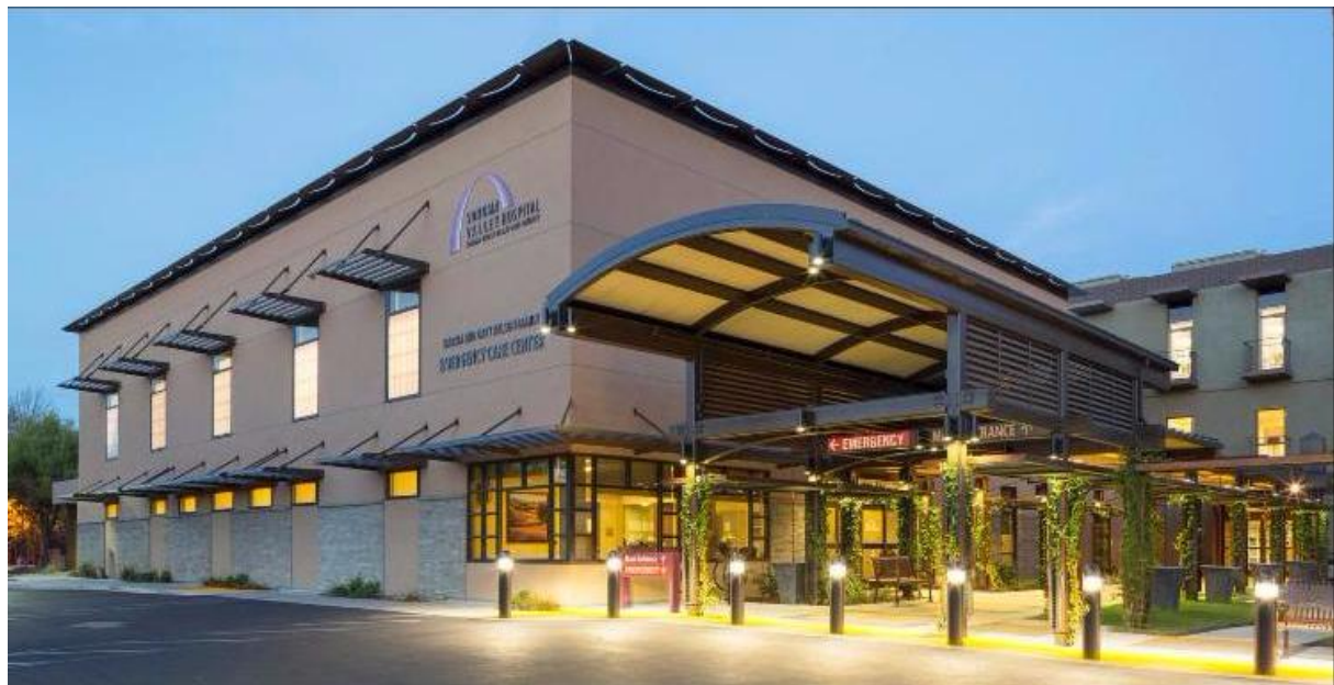
Inspiring Support for Sonoma Valley Hospital